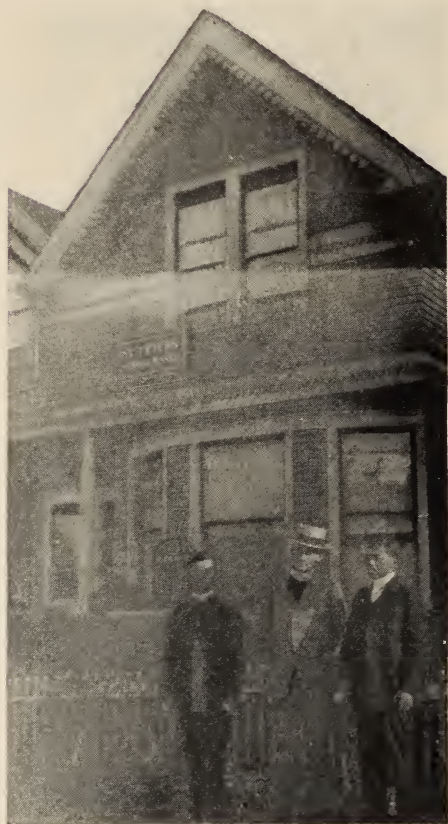
SAINT PETER'S MISSION, SEATTLE